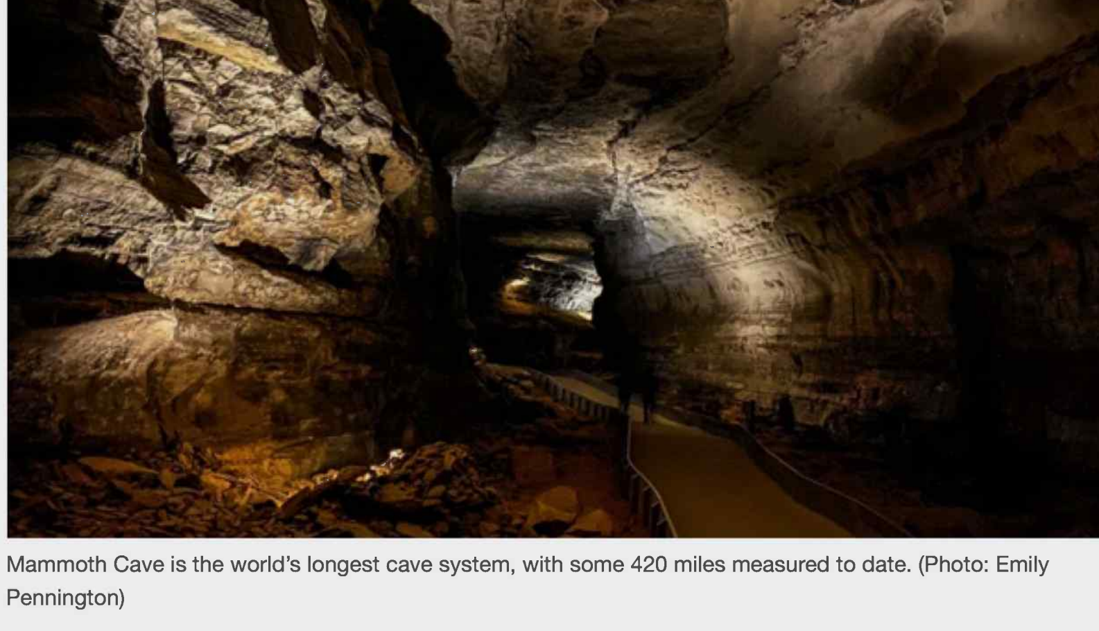
63 Parks Traveler Mammoth Cave Info

along the Cedar Sink Trail, shuffling my feet along the forest floor to a deep